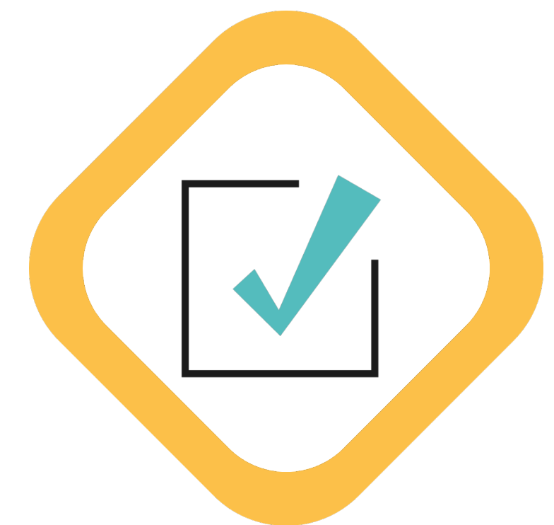
INDEFINITE BLANKET PERMIT (IBP) APPROVAL