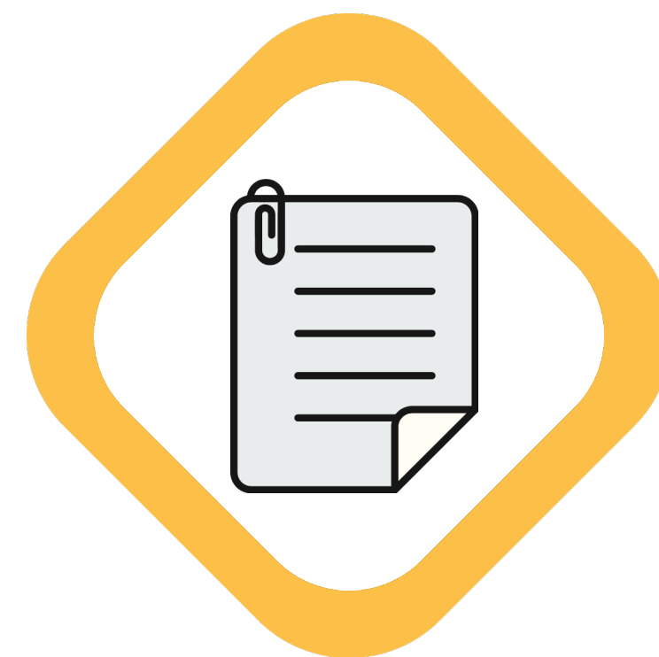
MEXICAN AOC CONVALIDATION